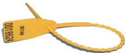
Yellow beaded seal pictured above.

The Secretary of State requires that ballots being transported be sealed to maintain security. When retrieving ballots from ballot drop boxes, a yellow beaded seal must be placed on the bag removed from the cavity of the ballot drop box. The seal number must be logged on the ballot drop box transport. Ballots being picked up from voter assistance centers will be in transport bags secured by yellow beaded seals. The seal number must be logged on the voter assistance center ballot transport form.