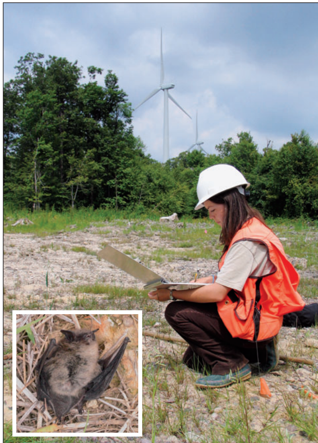
Figure 3. A field biologist records data on bat fatalities. (Inset) A little brown bat ( Myotis lucifugus ) carcass found beneath a wind turbine.

over 25 nights differed among turbine treatments in 2009 ( F_{2,33} = 6.94 , P = 0.005 ). There was no difference between the number of fatalities for C5 and C6 turbines ( \chi_1^2 = 0.24 , P = 0.616 ). Mean total fatalities at fully operational turbines were 3.6 times greater than those at curtailed turbines (C5 and C6 combined; \chi_1^2 = 12.93 , P = 0.0003 , 95% CI: 1.79, 7.26). In other words, in 2009, we found that 72% (95% CI: 44–86%) fewer fatalities occurred when turbines were curtailed in comparison with the number of fatalities when turbines were fully operational.