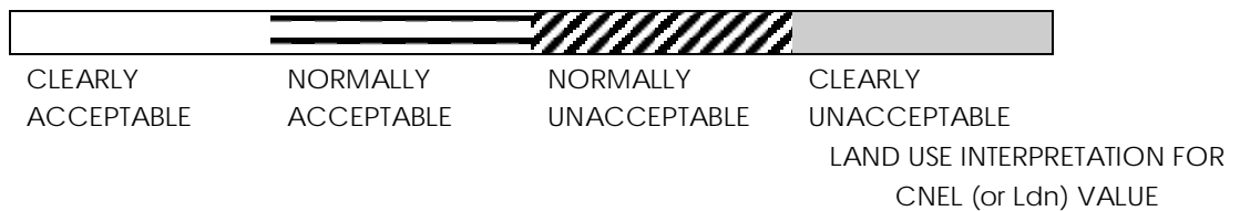
Table 13-D Land Use / Noise Compatibility Standards

The perception of nuisance will vary based upon sound level, frequency, and fluctuation. It also depends upon the character of the sound, number of noise events, familiarity and predictability, and the attitude of the listener. CNEL and Lmax are typically the basis for making nuisance determinations but other factors may be considered. For example, an annual high school parade may exceed residential noise levels but might not be deemed a nuisance.