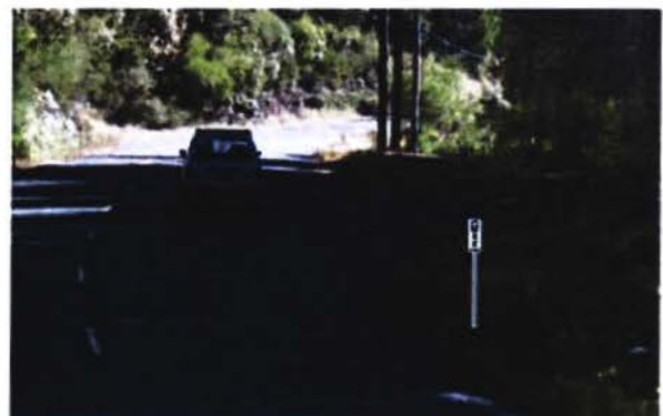
Above: Simulated paddle marker at a turnout on Briceland Thorne Road/Shelter Cove Road.