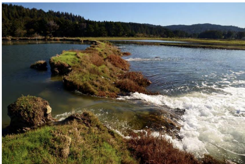
Dike overtopped during a King Tide inundating lands on South Bay 4

When breached, the 25.7 miles of highly vulnerable shoreline structures will expand the tidal inundation footprint of Humboldt Bay by 52% or nearly 9,000 acres. Breaching of dikes has already begun partially due to lack of, or deferred, maintenance. King Tides have also been a contributor. In addition to the dikes, there are 62 tide gates whose effectiveness can be compromised by rising sea levels. Areas impacted the most will include the Eureka Slough (7.13 miles), South Bay (5.1 miles), Mad River Slough (4.4 miles) and Arcata Bay and its railroad shoreline (4.0 miles).