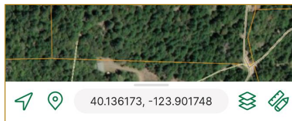
Figure 3. Map tools at bottom of active map.