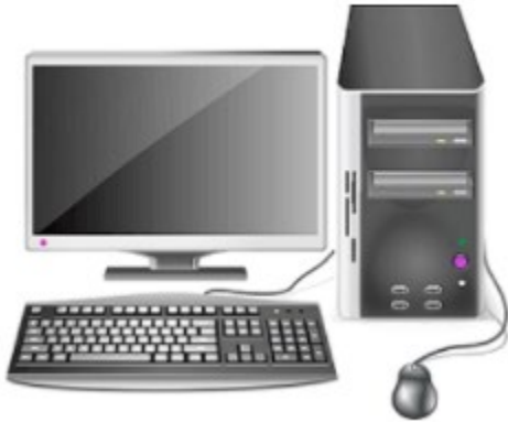
DESKTOP Web GIS 2.0