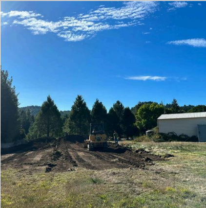
Emergency Water Storage Tank Site - Whitethorn Fire Department